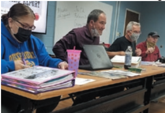
EARTH Officers at the September meeting.

Remember to Write Your Name On Your Equipment