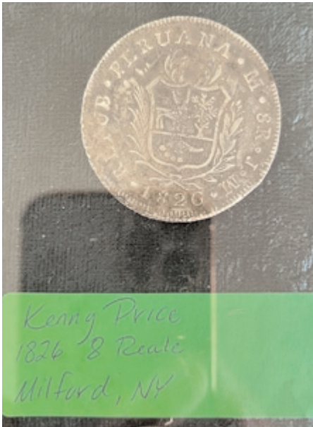
Kenny Price 1826 8 Reale Milford, NY