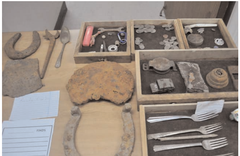
Bob Thomas's display at the September Meeting.

Mike Wusik September Finds 1865 Indian Head Cent Unknown Draped Bust Large Cent 1955-D Wheat Cent Buggy Break Crotal Bell - Whole Broken Bell Cluck Frame Back Pottery Whole Sand Dollar Reins Guide