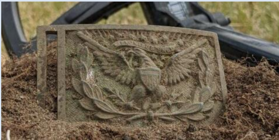
Pete Sorrell Civil War Sword Belt Plate