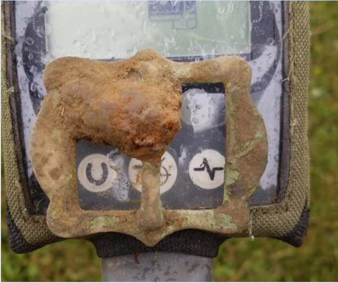
Dave Brown Batwing Buckle