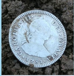
1781 Reale- Fred Decarlo

When displaying your entry, consider a description of what it is members are looking at. If it's a rare coin you may want to write down its value, or mintage number. Some members may copy a photo from the internet of a better example of their find. The more information members have, the better potential to accumulate points!