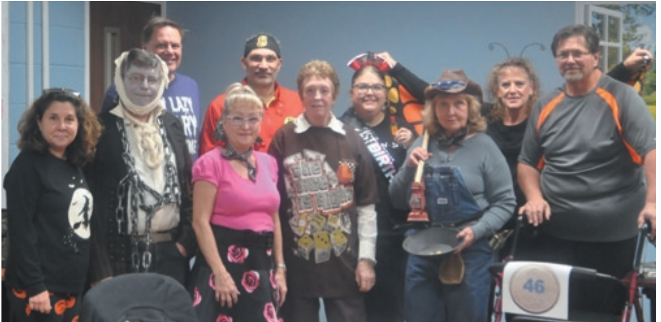
EARTH Club Members Celebrate Halloween in Costume

Metal Detecting Club of Central NY • Since 1990