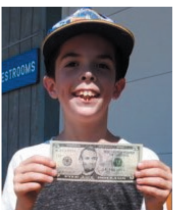
Little kid who won $5.00 in the Vial Hunt...