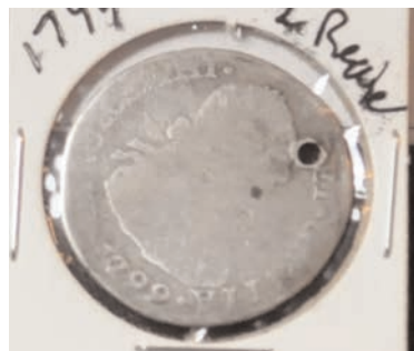
Best Foreign Coin Dave Dylis, 1799 2 Reale