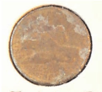
Best USA Small Cent Larry Ehlinge,r Flying Eagle, 1856-58