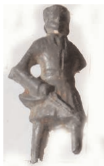
Best Toy Lori Fealey, Wounded Lead Solder