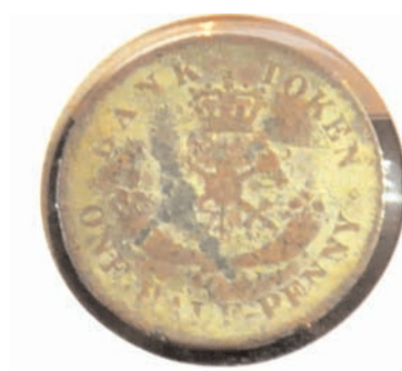
Best Token Larry Ehlinger, 1/2 Penny Token